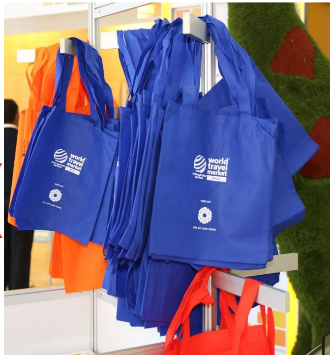
1 colour print