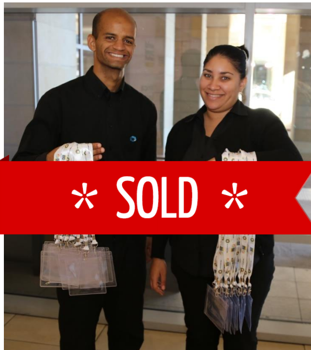
2 colour print

Welcome Bags and Lanyards are given to all visitors on arrival. This sponsorship provides the opportunity to have your logo reproduced in 1 colour on the bags with an insert inside the bags (production at cost of the sponsor) and on the bag holder and/or on the lanyards. Catalogue stands are also available for sponsorship on their own or as part of a package.